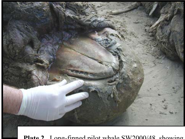
Plate 2. Long-finned pilot whale SW2000/48, showing tooth sockets in the upper palate.

The animal was subsequently identified by the tooth sockets in the upper palate as a long-finned pilot whale ( Globicephala melas ).