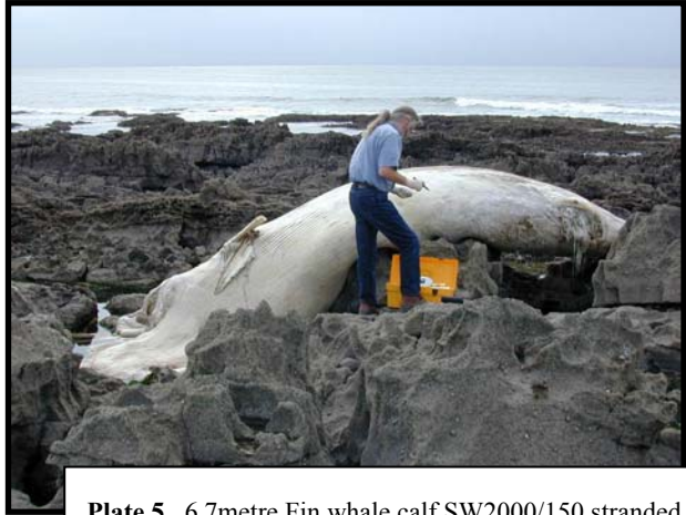
Plate 5. 6.7metre Fin whale calf SW2000/150 stranded on rocks at Slade on the Gower Peninsula.

SW2000/150 was reported stranded at Slade on the Gower Peninsula. This animal was identified as a 6.7metre female fin whale calf in a state of advanced decomposition. Samples were taken at site and the local authority contacted for disposal of remains. The carcass was left to break-up and decompose naturally as removal of the remains would have proved very difficult.