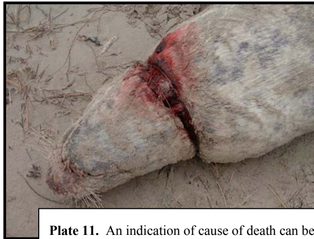
Plate 11. An indication of cause of death can be given via this imaging system as with this Grey seal at Harlech with monofilament netting around its neck.

During 2000 Gwynedd County Council installed up to date computers at all their Harbour offices and issued digital cameras to their Harbour Masters. This electronic imaging capability has enabled virtual immediate transfer of images for scrutinising by myself. This has enabled remote confirmation of species and determined condition of carcasses. Images can also be relayed to the Natural History Museum for confirmation of unusual species and the Institute of Zoology for discussion on unusual injuries. This facility has enabled a saving on travelling expenses by reducing the amount of call-outs on animals unsuitable for post-mortem examination and has improved the accuracy of reported species in the Gwynedd County. In some cases this electronic image capability has even given an indication as to the cause of death.