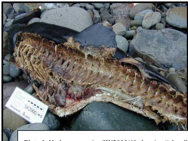
Plate 1. Harbour porpoise SW2000/40 showing “clean” blubber edge over rock.

SW2000/40 was reported stranded on the 8 th March at Druidstone, Pembrokeshire. This harbour porpoise ( Phocoena phocoena ) had very likely been filleted. The whole muscle mass from the left hand side of the animal had been removed. The straight edge of the blubber laying over the rock would indicate that this was not caused by scavenger damage.