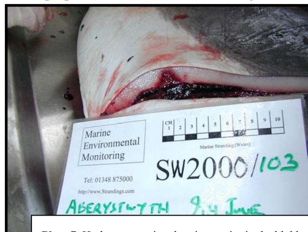
Plate 7. Harbour porpoise showing cavity in the blubber caused by being rammed by Bottlenose dolphin.