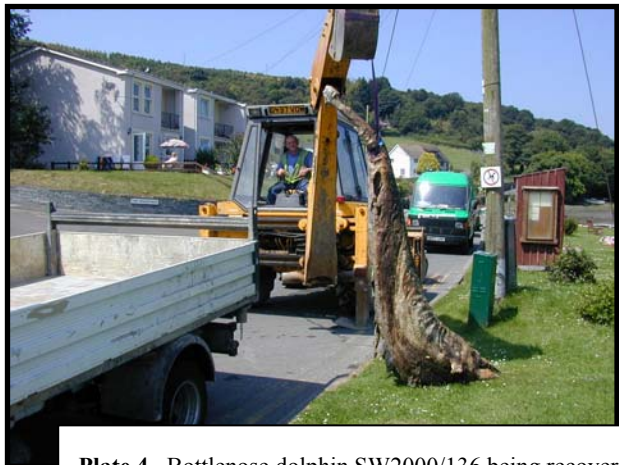
Plate 4. Bottlenose dolphin SW2000/136 being recovered at St Dogmaels on the River Teifi.

The carcass was winched onto the riverbank where it was lifted into a truck by JCB and removed for safe disposal by the local authority.