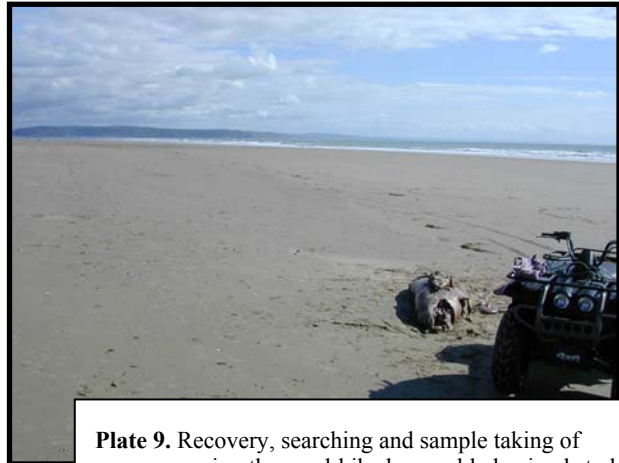
Plate 9. Recovery, searching and sample taking of carcasses using the quad-bike has enabled animals to be included that would previously not have been found.

In the event of a Leatherback turtle requiring transportation, or a larger cetacean, the ramps can easily be removed by sliding out two locking pins.