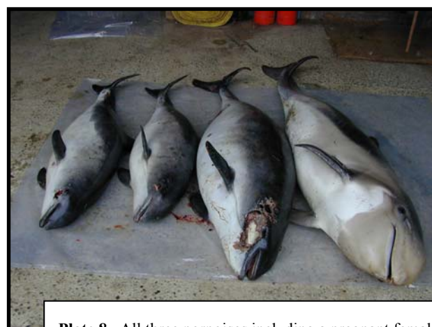
Plate 8. All three porpoises including a pregnant female were killed by Bottlenose dolphins.