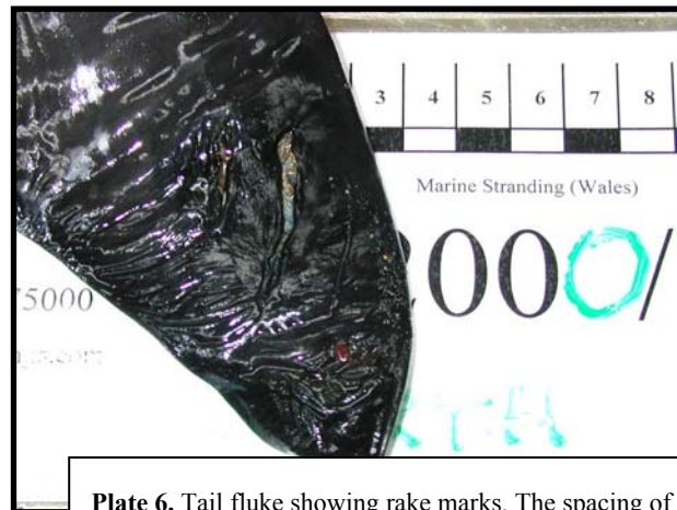
Plate 6. Tail fluke showing rake marks. The spacing of the marks match that of Bottlenose dolphin teeth spacing.

On the 25 th October 2000, five cetacean strandings were reported. Four of these were in a fresh condition for post-mortem examination. The four animals consisted of three porpoises and a Risso’s dolphin calf; the largest of the porpoises was pregnant. All three porpoises were determined to have died as a result of violent interaction with bottlenose dolphins.