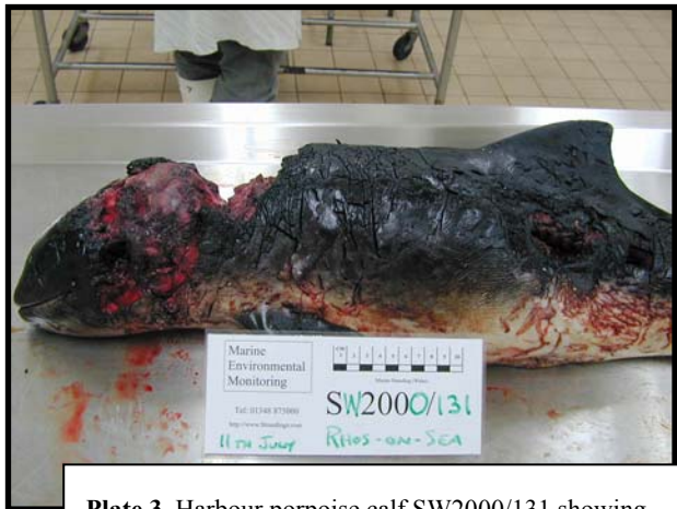
Plate 3. Harbour porpoise calf SW2000/131 showing damage to rear of head.

A boat propeller or other severe impact may have hit this animal.