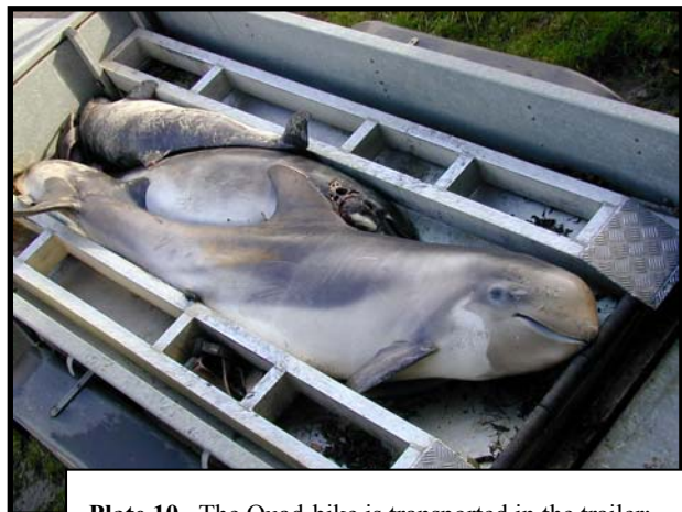
Plate 10. The Quad-bike is transported in the trailer; ramps allow sufficient clearance for the stranding to fit underneath.