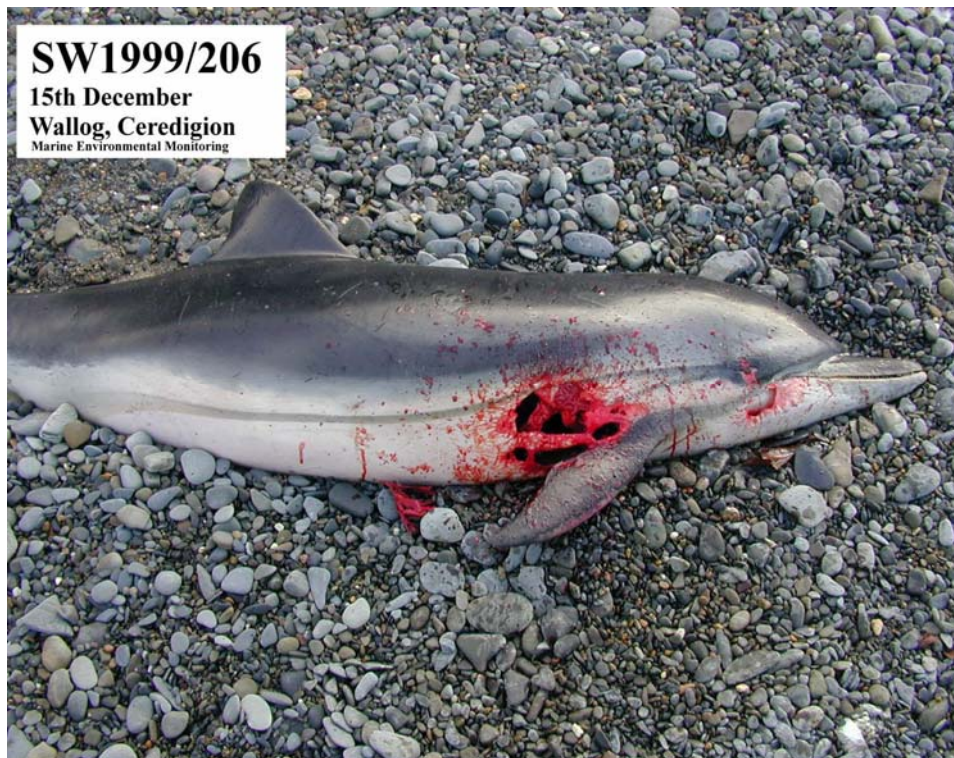
Digital image sample, showing the quality of image that can be sent via email to IOZ/NHM.