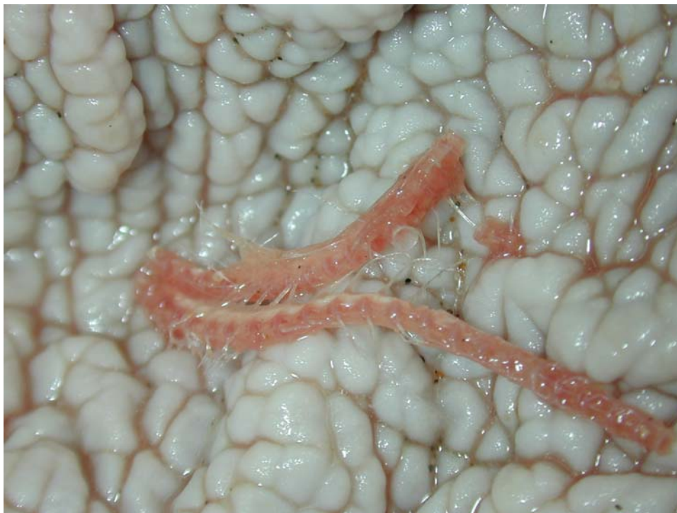
Digital image of fish spine in Harbour porpoise stomach.